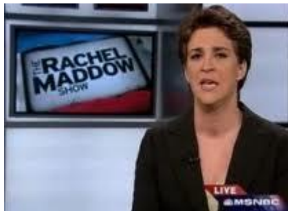
Rachel Maddow MSNBC